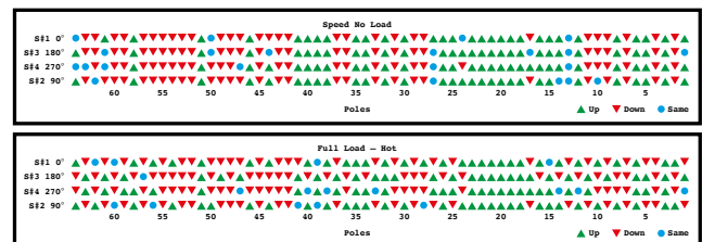
Figure 3: Histogram of adjacent pole correlation at SNL and FLH. The correlation is much more uniform at SNL from one sensor to another with 51 matching sets out of 64 poles and 7 near matches. In comparison, the FLH result is mixed with only 22 matching sets and 9 near matches.