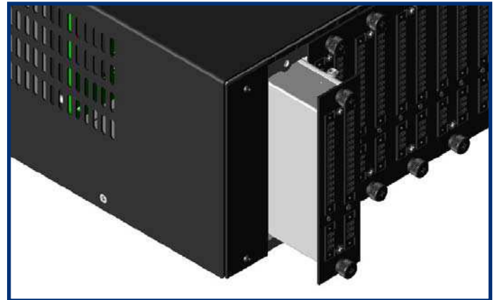
View of ZPU-5000 plug-in modules